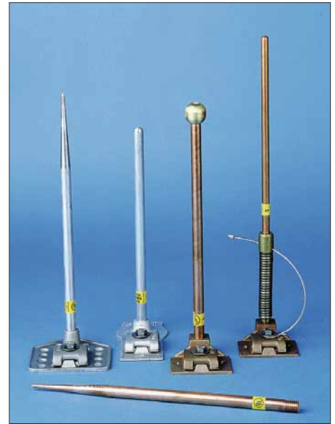
Various rooftop rods