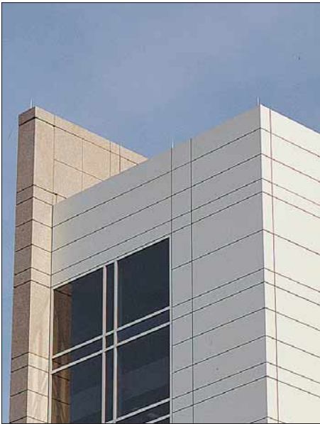
Typical commercial system